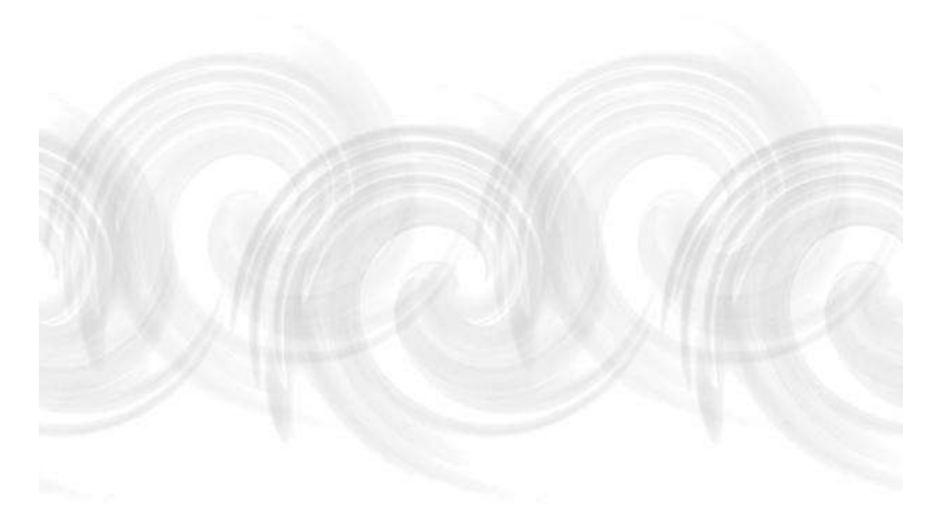
© 2009 e-gens. All rights reserved.

And already now we change And already now we change And already now we change And already now we change